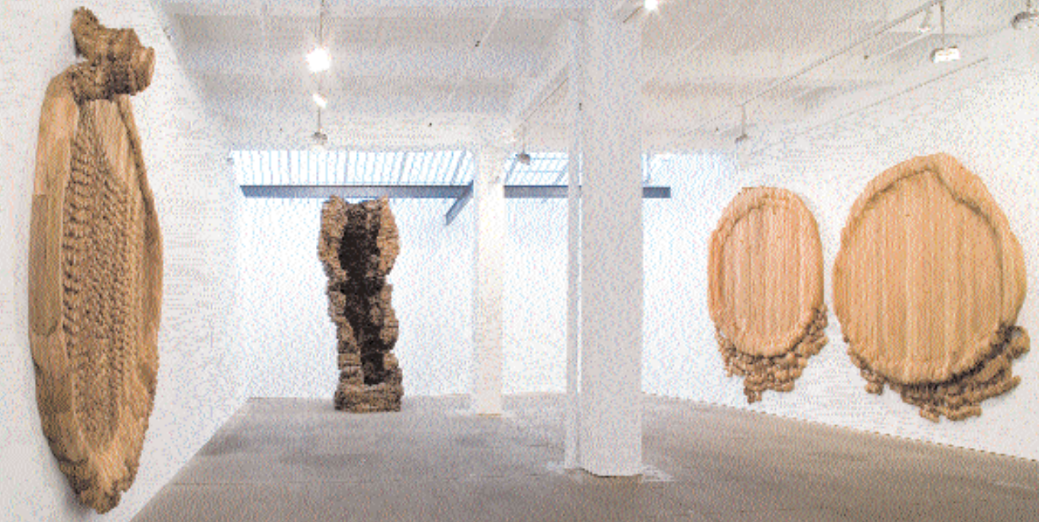
Previous spread: Five Lace Medallions , 2003–06. Cedar, graphite, and chalk, 5 units, 116.5 x 501 x 9 in. This page, above: Installation view of “Sylwetka,” 2006. Left: Exploding Bowl , 2005–06. Cedar, 32 x 56 x 55 in.