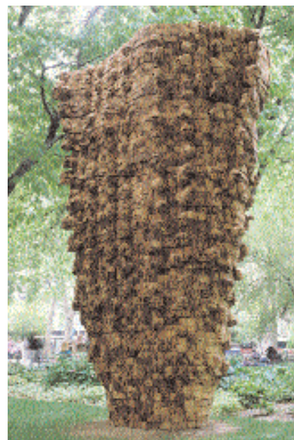
Left: berwici pici pa , 2004. Cedar and graphite, 1,040 x 96 x 65 in. Above: Czara z babelkami , 2006. Cedar, 202 x 125 x 74 in.

I know they're reliefs, but, to me, they're mainly drawings that I first did with chalk, then pencil, and finally cut with a circular saw in such a way that I either disrupted or amplified what was there to jar those drawings and give them greater depth.