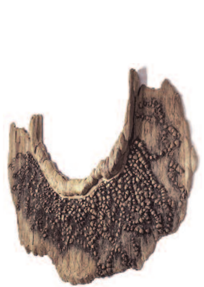
Left: LUBA , 2010. Cedar, graphite, and bronze, 212 x 139 x 88 in. Above: Collar with Dots , 2008. Cedar and pigment, 115 x 137 x 7.5 in.

As a footnote, I like to have my wood feel as though it has a history. I don't want it to feel futuristic or as though it was made in the 1950s, 1920, 2010. I want it to feel as though one can't pin down its age. Not always, but often, the more the work gets handled—marked on, chewed away with a little chiseling that we do to take the glue out (because a lot of it drips over the edges, which it should in order to make a complete seal)—the more it gets touched, the more it gets turned over, and, in some ways, the more it gets abused and used, the more history it carries with it, the greater the degree of visual substantiality.