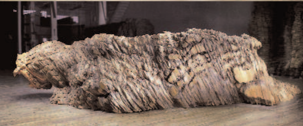
Above and left: Droga (front and back views), 2009. Cedar and graphite, 54 x 115 x 219 in.