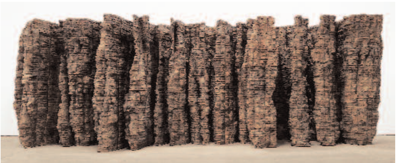
Blackened Word (back view) , 2008. Cedar and graphite, 81 x 248 x 78 in.

me to have another opportunity for the kinds of wedges that I want to build into walls.