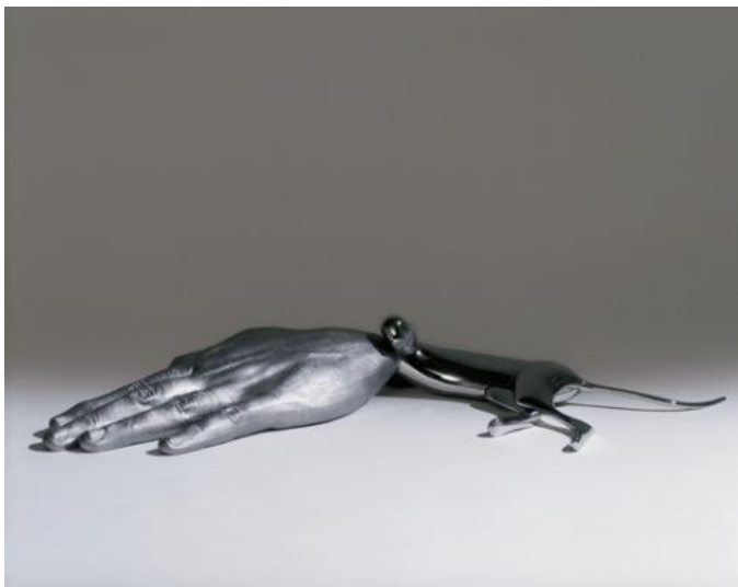
Rona Pondick, Cat , 2002–5, Stainless steel, Edition of 3, AP, 4 ½ x 33 x 14 1/8 in., Courtesy Galerie Thaddaeus Ropac, Paris/Salzburg; Sonnabend Gallery, New York; and the artist