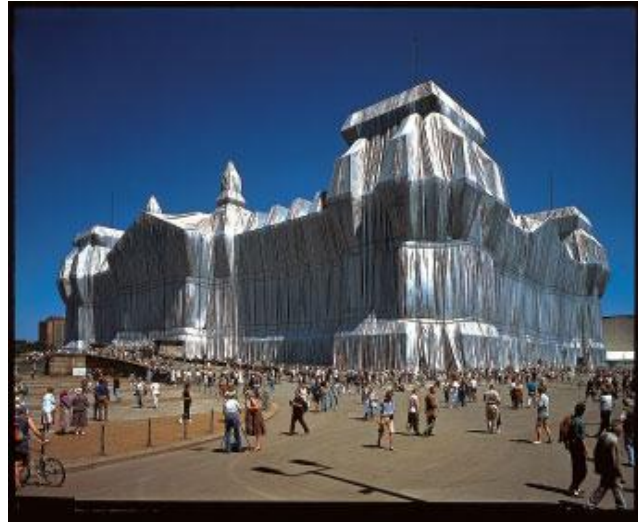
Wrapped Reichstag, Berlin, 1971-95. 100,000 square meters of polypropylene fabric and 15,600 meters of rope.