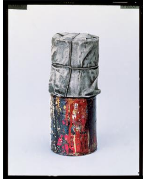
Wrapped Cans, 1952. Fabric, rope, enamel paint, and tin cans, 13 x 10 cm. each.

JGC: You are probably aware that an e-mail was going around that you were planning on permanently wrapping the White House with plastic and duct tape in the name of world peace. Do you take it as a compliment that many consider your work an alternative to war?