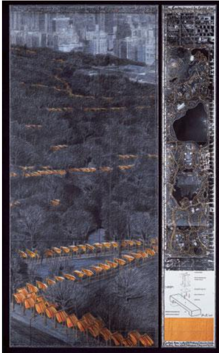
The Gates, Project for Central Park, New York City, 1997 Pencil, charcoal, pastel, wax crayon, aerial photograph, and fabric sample, two parts: 224 x 106.6 cm.; 244 x 38 cm.

Christo: Let's take The Gates project first. How did The Gates project start? We had other proposals for New York City between 1964 and '68, which is a completely different story—they involved buildings. Then we did a lot of projects outside of Manhattan—in Australia, in the Rocky Mountains in Colorado, in California, and Loose Park in Kansas City, Missouri. More and more, our interest in the architecture in Manhattan moved to people walking in the streets. In Manhattan, people walk so much on the sidewalks. At some moments, Jeanne-Claude and I were contemplating using the sidewalk to do a project involving people simply walking.