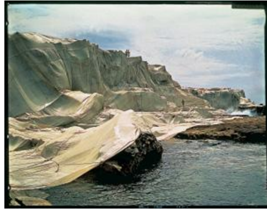
Wrapped Coast, One Million Square Feet, Little Bay, Sydney, Australia, 1968-69. 90,000 square meters of erosion-control fabric and 56.3 kilometers of rope.