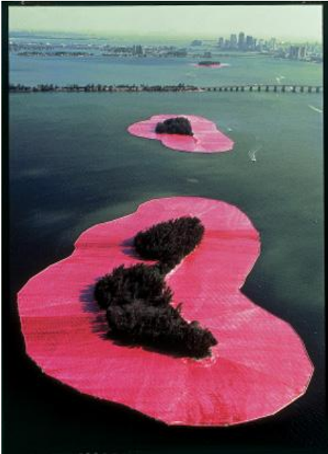
Surrounded Islands, Biscayne Bay, Greater Miami, Florida, 1980-83. 585,00 square meters of fabric floating around 11 islands

C: And, of course, all of our projects are living objects. The still photographs don't give a fair understanding, because these projects are in constant motion—the wind is blowing the folds, the pleats. The Reichstag for 14 days was like a living object, breathing, moving in the wind, and, of course, changing the color and the shapes of the shadows of the folds. This project involved a tremendous dynamic quality, and this is a very important part of all of our projects. They're not static, not like wood, stone, and steel. Running Fence was always moving—it was showing the extraordinary power of the force of the wind. The Surrounded Islands were moving with the surf, with the waves of the ocean. All these projects are very dynamic structures.