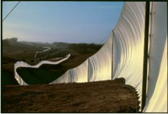
Running Fence, Sonoma and Marin Counties, California, 1972-76. 200,000 square meters of nylon, steel poles, and steel cables.

J-C: So were The Umbrellas—blue in Japan, yellow in California. In both countries, the umbrellas were in front of temples, churches, gasoline stations, schools, highways, and bridges. Running Fence was on the property of 59 ranchers who lived there, who had their ranches there and their cattle guards.