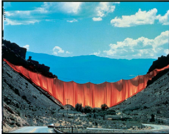
Valley Curtain, Rifle, Colorado, 1970-72. 12,780 square meters of nylon, cables, and rope.

C: This is the color of autumn. On a very cold winter day, in a bare, gray park, you have the reminiscence of the foliage of autumn.